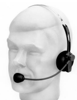
Ultralightweight (not noise attenuating)

Call 1-800-900-3434 for assistance in configuring your system