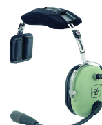
Over-the-Head Single Ear