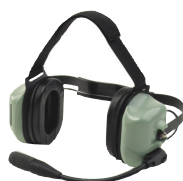
Behind-the-Head (For use with safety caps)